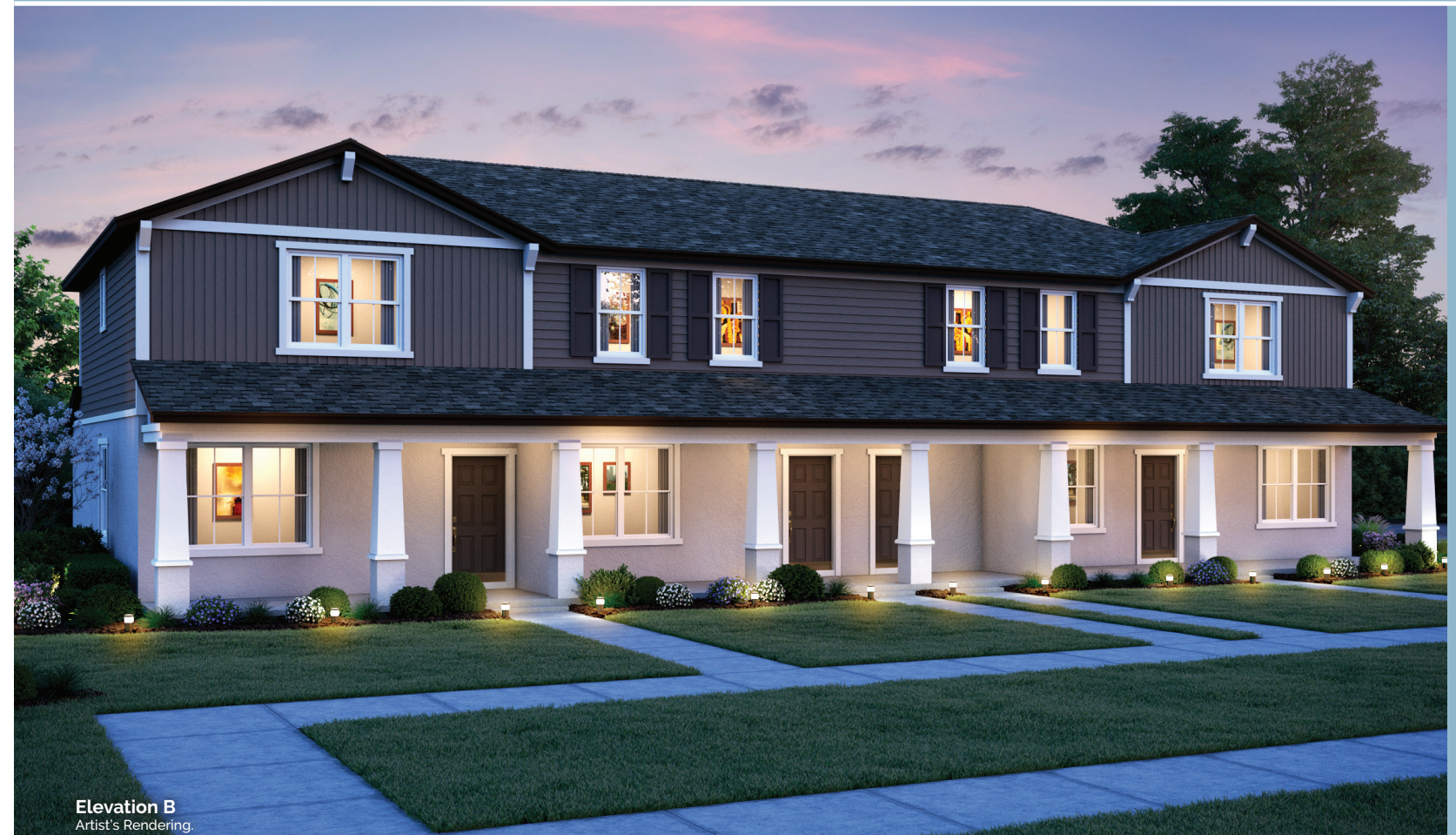
Elevation B Artist's Rendering.